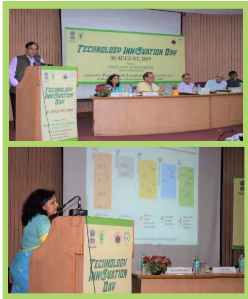
2. IP MANAGEMENT

ZTM & BPD Unit has been playing an active role in Intellectual Property Management of the IARI institute. In the FY 2019-2020, five (5) patents were granted, two (2) new patent applications, fifteen (15)